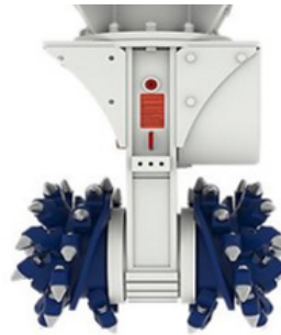
Rotary Cutter - Soft Rock Only