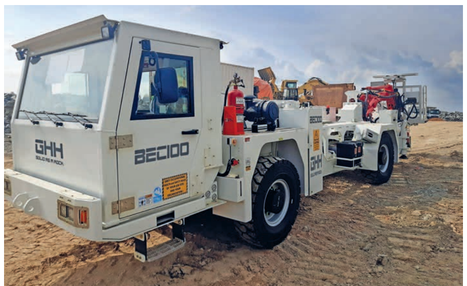
The GHH BEC100 emulsion charger truck

The entire range of products all have CE Certification, ROPS & FOPs level 2 certified closed cabins and powershift transmissions (hydrodynamic), 4x4 all-wheel drive and articulated steering for superior manoeuvrability. GHH told IM : "With over 1,000 active units in the field, and a constant drive to develop new and competitive equipment and an intense focus on