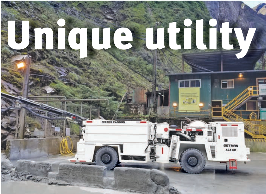
The new Getman A64 HD Water Cannon at a mining customer site in Indonesia