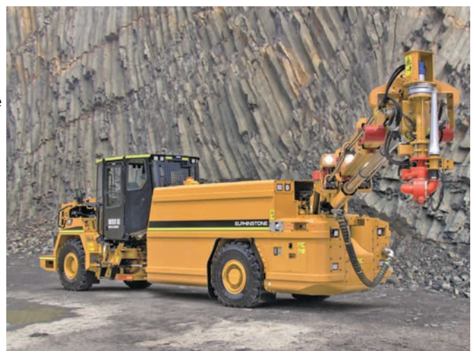
The WR810 Water Cannon washes down valuable ore fines by reaching into the stope