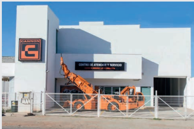
Cannon Mining has seen demand growth for its products in Latin America

Other general updates on the Cannon line of course have been on high Tier engines up to Tier 4, and updated axle designs. Diesel or electric cable is offered on the drilling and bolting rigs. The company has also had battery machine R&D projects in the past and is looking at these again.