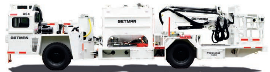
Two of Getman's latest utility offerings – the ProShot concrete sprayer and ProCharge MAXX 4000 integrated emulsion charger