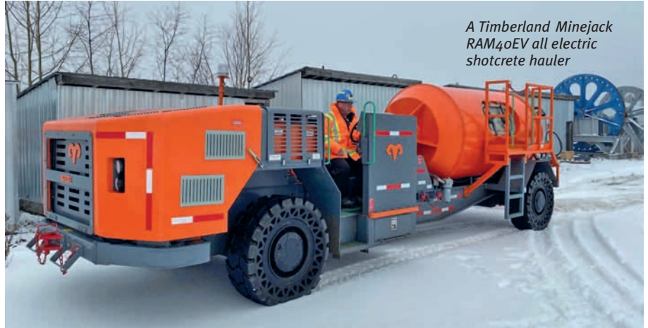
A Timberland Minejack RAM40EV all electric shotcrete hauler